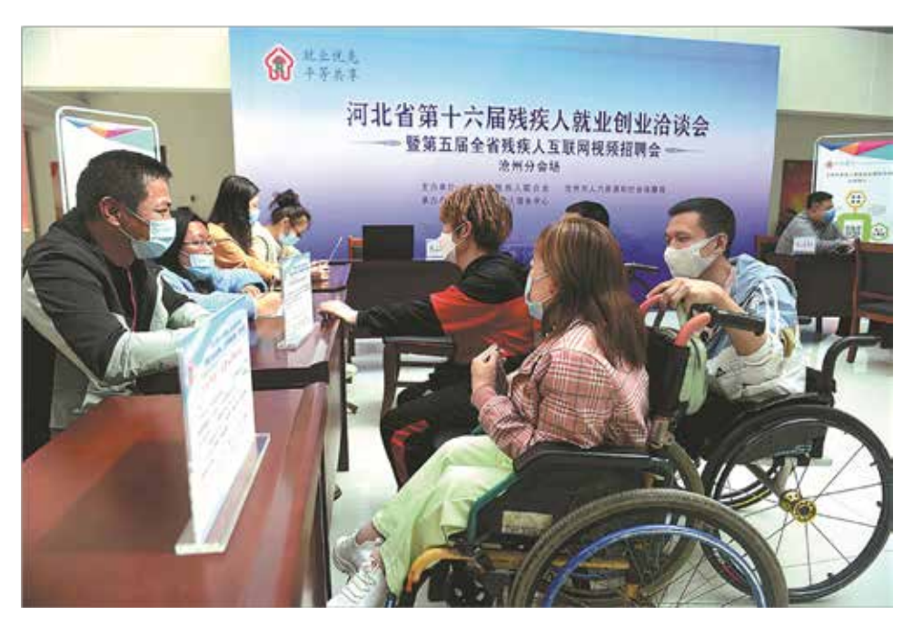
Job seekers consult employers at a career fair for disabled people in Cangzhou, Hebei province, in May, 2022.

China has made continuous efforts to protect the human rights of disabled people, especially disabled women, by securing their right to work and securing legal protections.