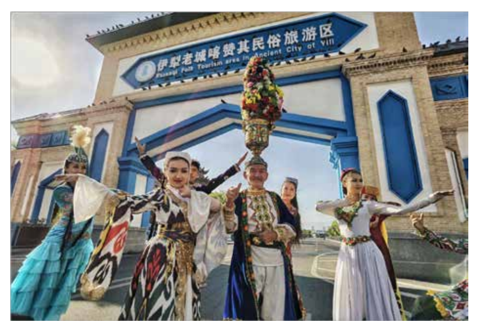
Local people perform dancing for tourists in the Kazanqi folk tourism village, a popular scenic spot in the Xinjiang Uygur Autonomous Region

China has attached great importance to improving the livelihoods of people from different ethnic groups and their human rights since 2012. Attempts to use ethnic and religious issues to create conflict in China will never succeed, said the deputy director of a Chinese association for promoting exchange in ethnic affairs.