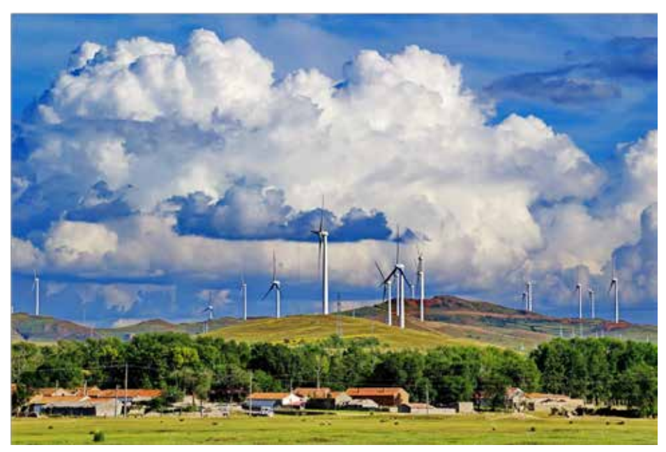
A file photo shows a wind power plant in Zhangjiakou, North China's Hebei province.

China has made consistent efforts to bolster environmental legislation and awareness of environmental rights in recent decades in a bid to improve human rights.