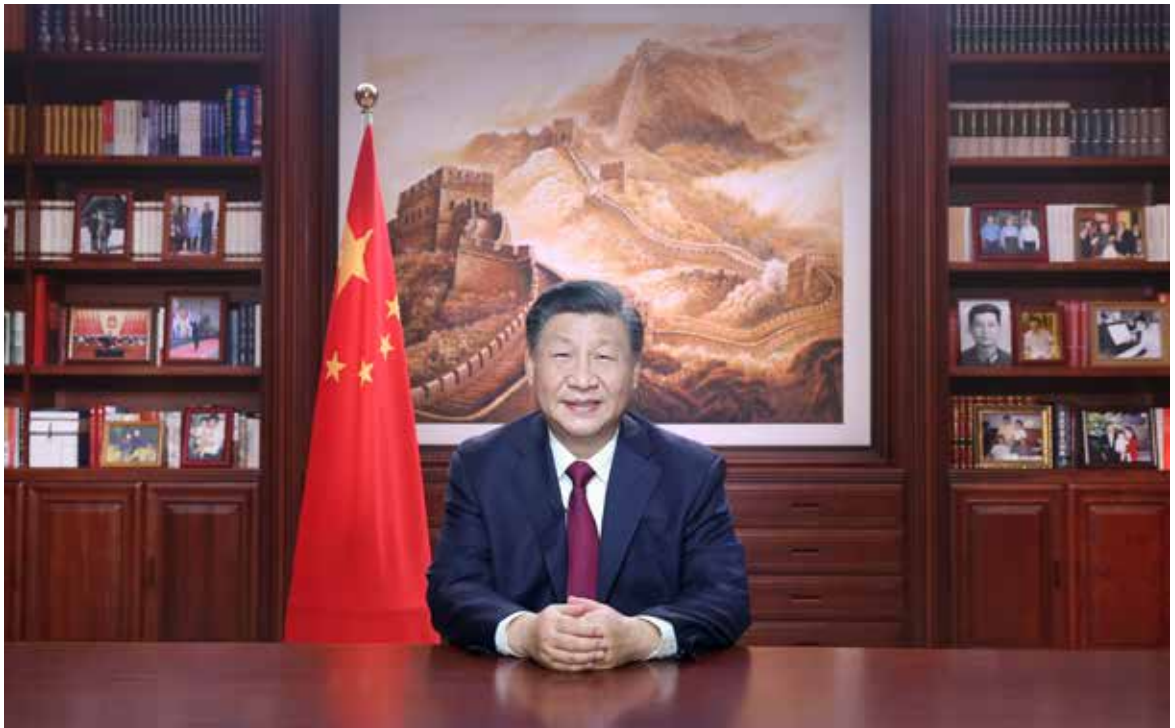
President Xi Jinping delivers a New Year address on Saturday evening, Dec 31, 2022, in Beijing to ring in 2023.

BEIJING- On New Year's eve, President Xi Jinping delivered his 2023 New Year Address through China Media Group and the Internet. The following is the full text of the address: