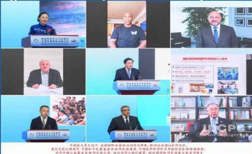
In August, SIRONET members participated in the International Civil Society Solidarity Conference on the Global Development Initiative