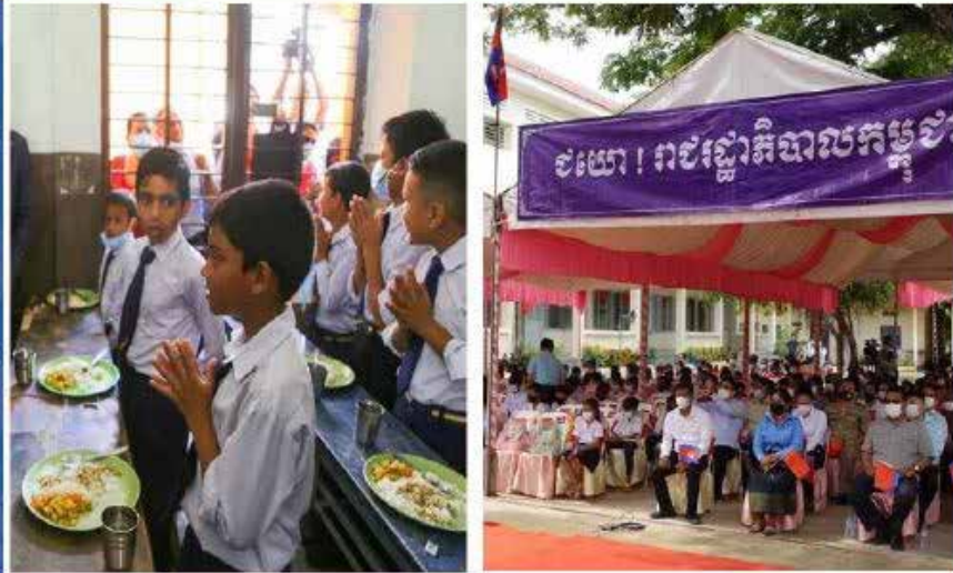
From July to August, SIRONET members participated in the Nepal Smiling Children Project and China-Cambodia Love Kits Project with the support of the Global Development and South-South Cooperation Fund