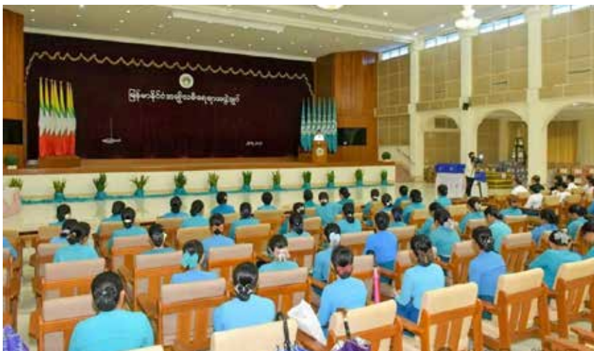
The “Silk Road People-to-People Connectivity” Handover Ceremony of Humanitarian Aid Supplies