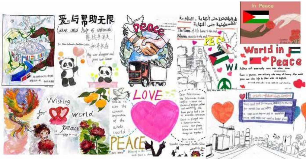
The picture shows charity artworks titled “Hearts with Hope, Love for Gaza” created by students from Wenzhou, Zhejiang.