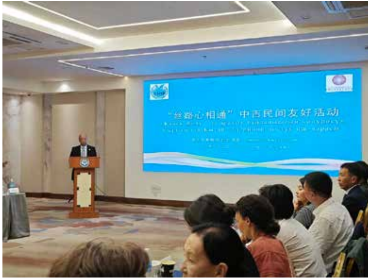
Li Hua, Minister-counsellor of the Chinese Embassy in Kyrgyzstan, delivered a speech.